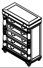
Drawer chest 1pc